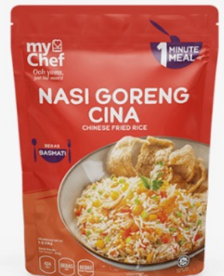
NASI GORENG CINA