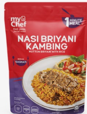
NASI BRIYANI KAMBING