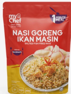
NASI GORENG IKAN MASIN