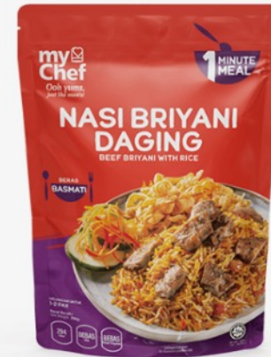
NASI BRIYANI DAGING