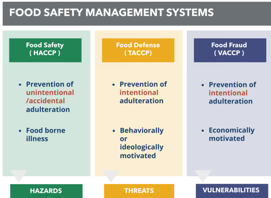
Figure 2. Differences between HACCP, TACCP, and VACCP (GFSI)